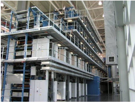
Partial view of one of the two web press lines at The Kansas City Star , whose EAE systems will be brought up to date over the next two years with the latest generation of hardware and software.

“Taking account of our printing needs, each project phase can be completed faster with this strategy. What’s more, modernising all of our presses at once would have been something of a risky venture, and we can now split the costs between two annual budgets,” Waters explains. “I can only describe the cooperation with QIPC – EAE Americas as excellent. They’re a partner who understand our requirements, and they presented us with a made-to-measure solution. We’re convinced that QIPC – EAE Americas will also make a very good job of things when it comes to actually implementing the retrofit project.”