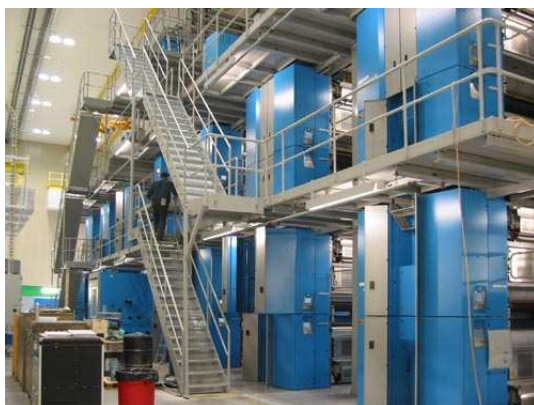
The press at the North Jersey Media print site at Rockaway, New Jersey