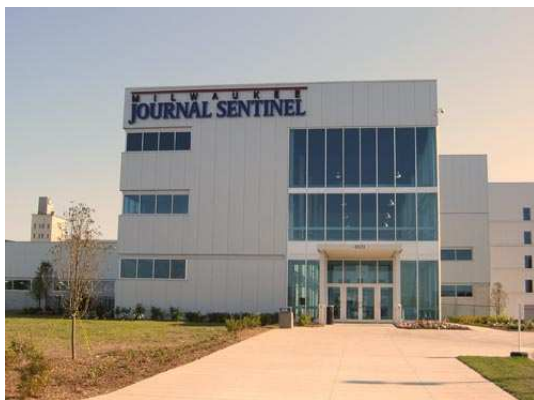
The print center of the Milwaukee Journal Sentinel