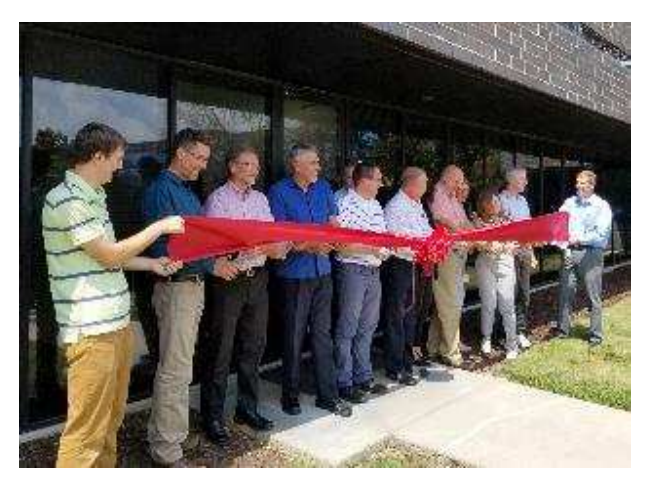
Long-term employees join for the ribbon-cutting ceremony at BALDWIN Vision Systems' new Waukesha headquarters.

Former competitors QuadTech, Web Printing Controls, PC Industries combine products, expertise, engineering talent