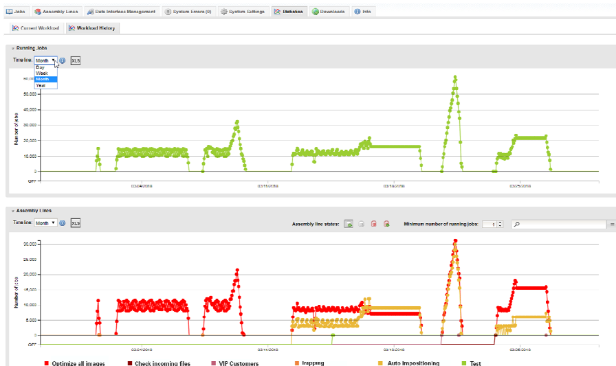
Image 1: The workspace statistics show, among other things, how many files were processed in the past month