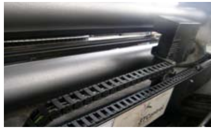
IPA travels across the web width and uses the same camera system to monitor different parameters.

All the printer must do is to start up the system and then track the progress of the print run on the monitor; thus becoming production supervisor.