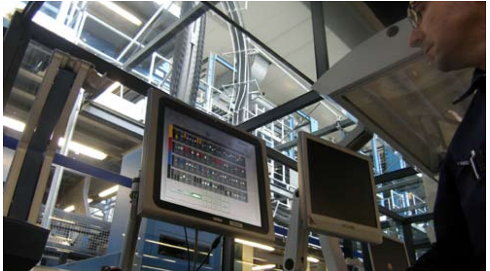
The monitor at the press control desk at Heraldo de Aragón in Saragossa, Spain, shows the colour corrections carried out automatically by the IPA system in real time.

IPA measures and controls various print parameters – including colour density – by means of a single camera system.