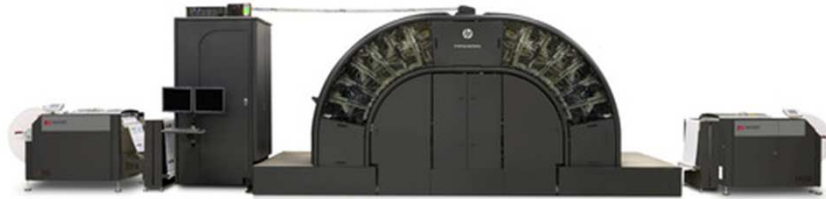
HP T 230