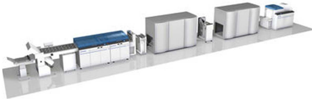
HUNKELER DIGITAL NEWSPAPER SOLUTION