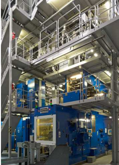
The Wifag OF370 at The Chronicle Herald

Additional photo material (hi-res photos in separate files):